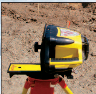
Rugby 200 with mounting bracket