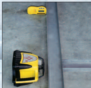
Rugby 200 with Rod-Eye Sensor in a lay-down position